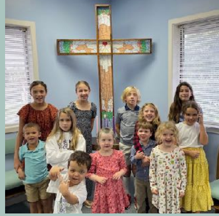
The children from the family service lighting the advent wreath